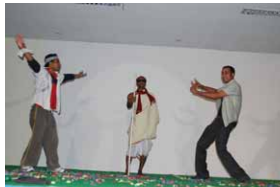
Best play (Gandhi Chowk)