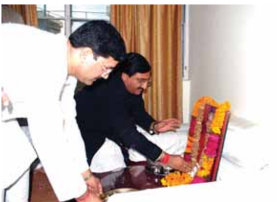
CM Uttarakhand Dr. Ramesh Pokhariyal and VC HIHT University paying respects at Swami Rama Centre