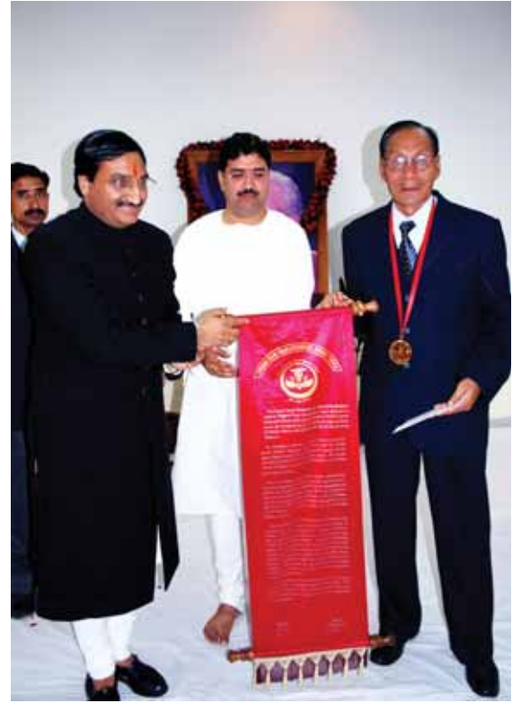
CM Uttarakhand presenting the Swami Rama Humanitarian Award