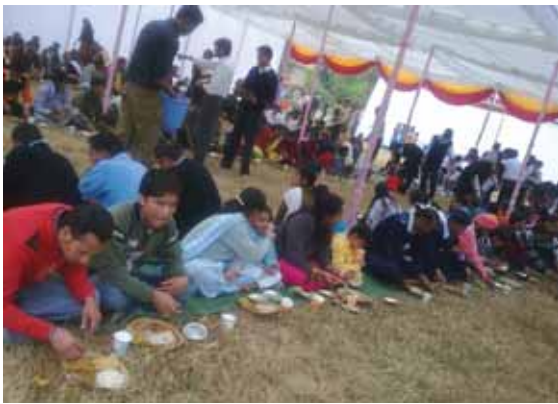
People enjoying bhandara