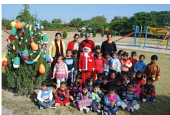
Christmas party celebrated at Vidya School