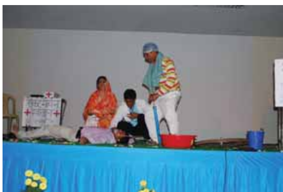
A cycle repairman resuscitating the patient in a play