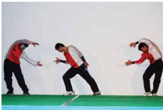
Best group dance