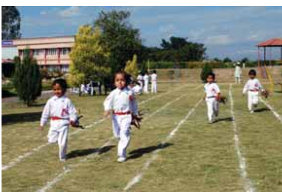
Children participating in Sports Day