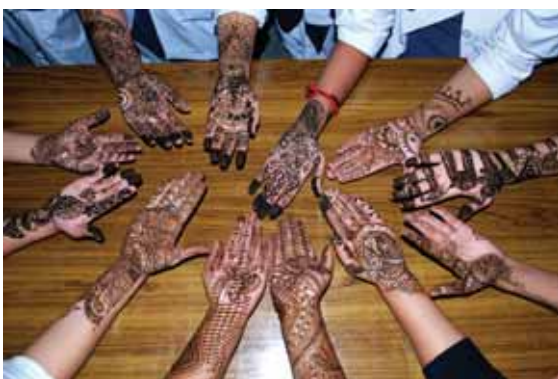
Students with mehendi hands

A committee of HIHT University organized literary events 9- 11 November 2009. MBBS and paramedical students enthusiastically participated in various literary activities like essay and story writing, face-painting, collage, rangoli, mehendi, and card-making. Topics for each event revolved around education as 11 November was Education Day. Winners were announced and awarded on Annual Day (18 December 2009).