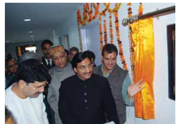
CM Uttarakhand inaugurating first phase of CRI

The programme at the auditorium started with Guru Vandana. Hon'ble Chancellor of HIHT University, gave away Swami Rama Scholarships to approximately 300 students. Some children of the employees, 15-20 students of professional education