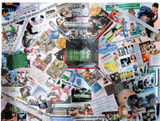
Best collage on the topic—Education Over the Years