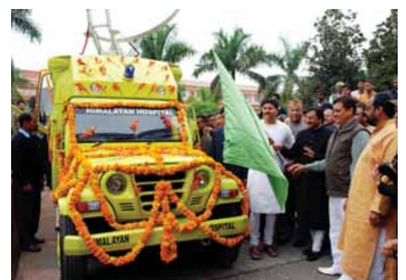
CM Uttarakhand flagged off the Mobile Satellite van