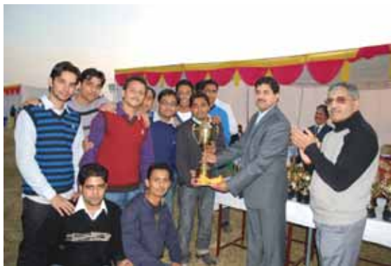
Batch 2005—winners with trophy