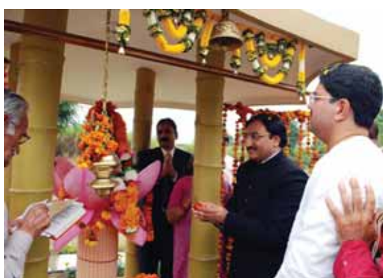
CM Uttarakhand inaugurating Dhanvantri statue